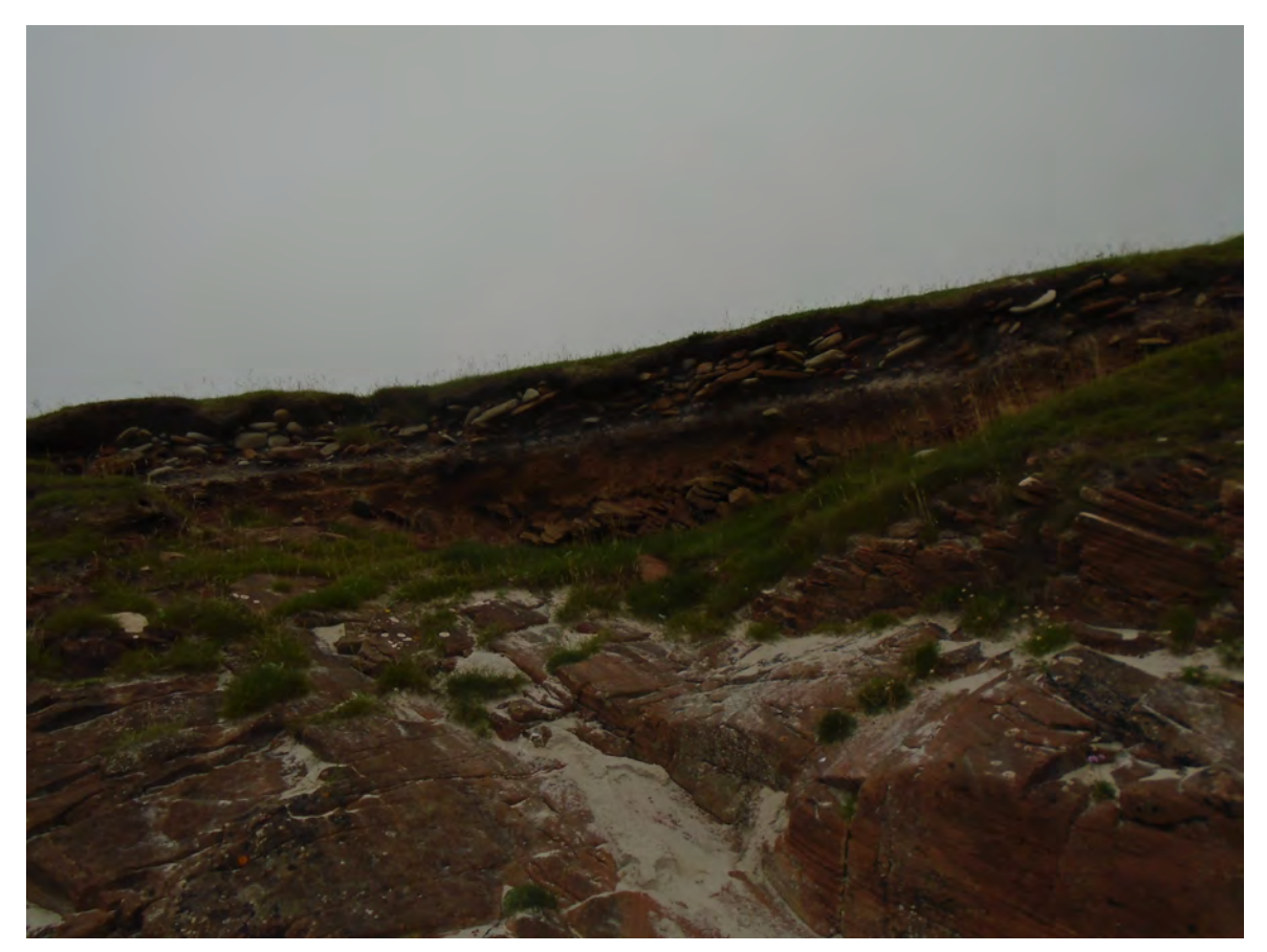
Plate 38 Structural remains (Site 132) eroding from cliff edge from east