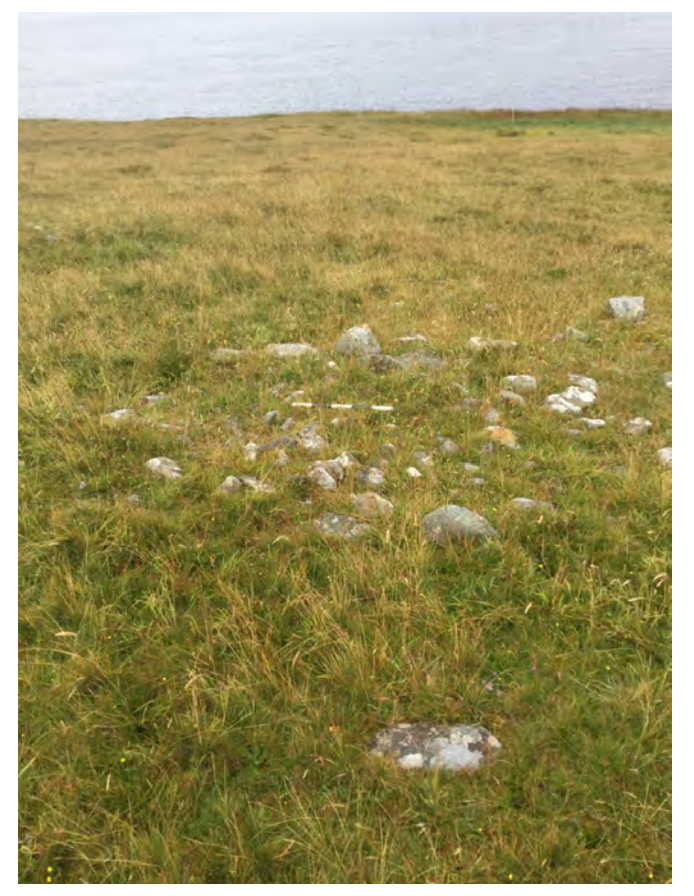
Plate 4 Cairn (Site 61) from south-west.