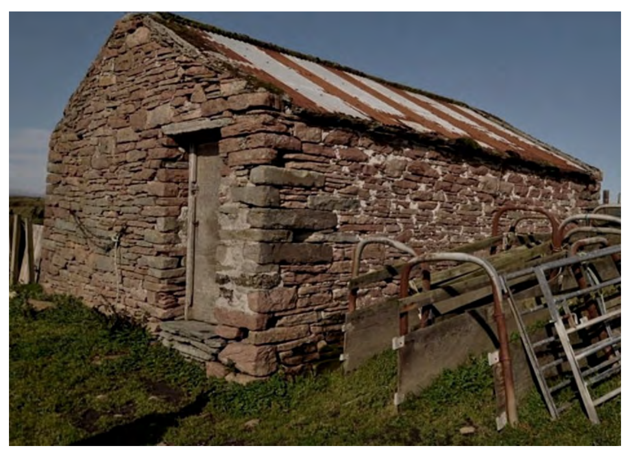
Plate 34 Boathouse (Site 34) from south-east