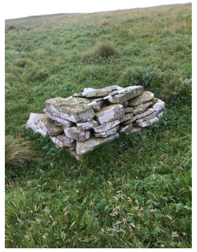
Plate 8 Neatly stacked cairn (Site 102) on west coast from south