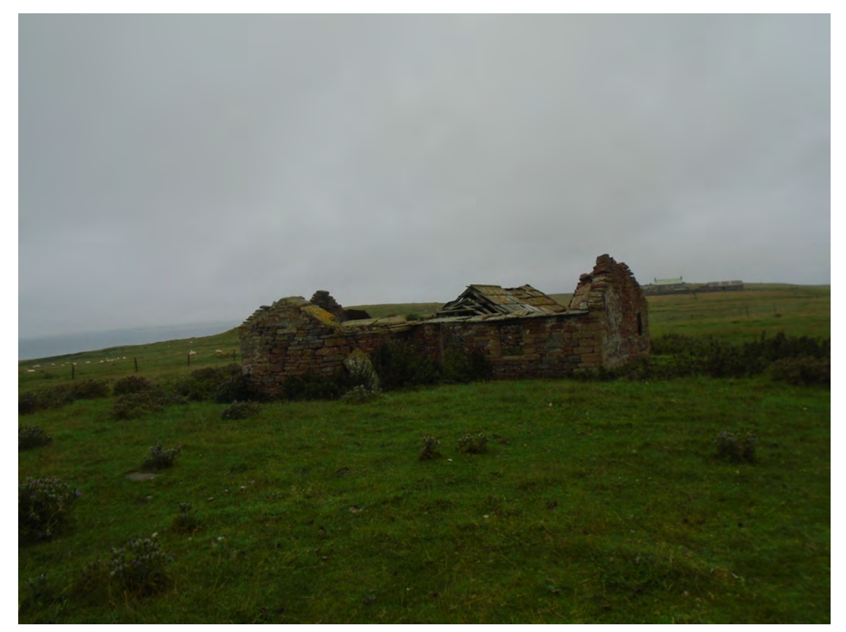
Plate 25 Roadside (Site 14) from south