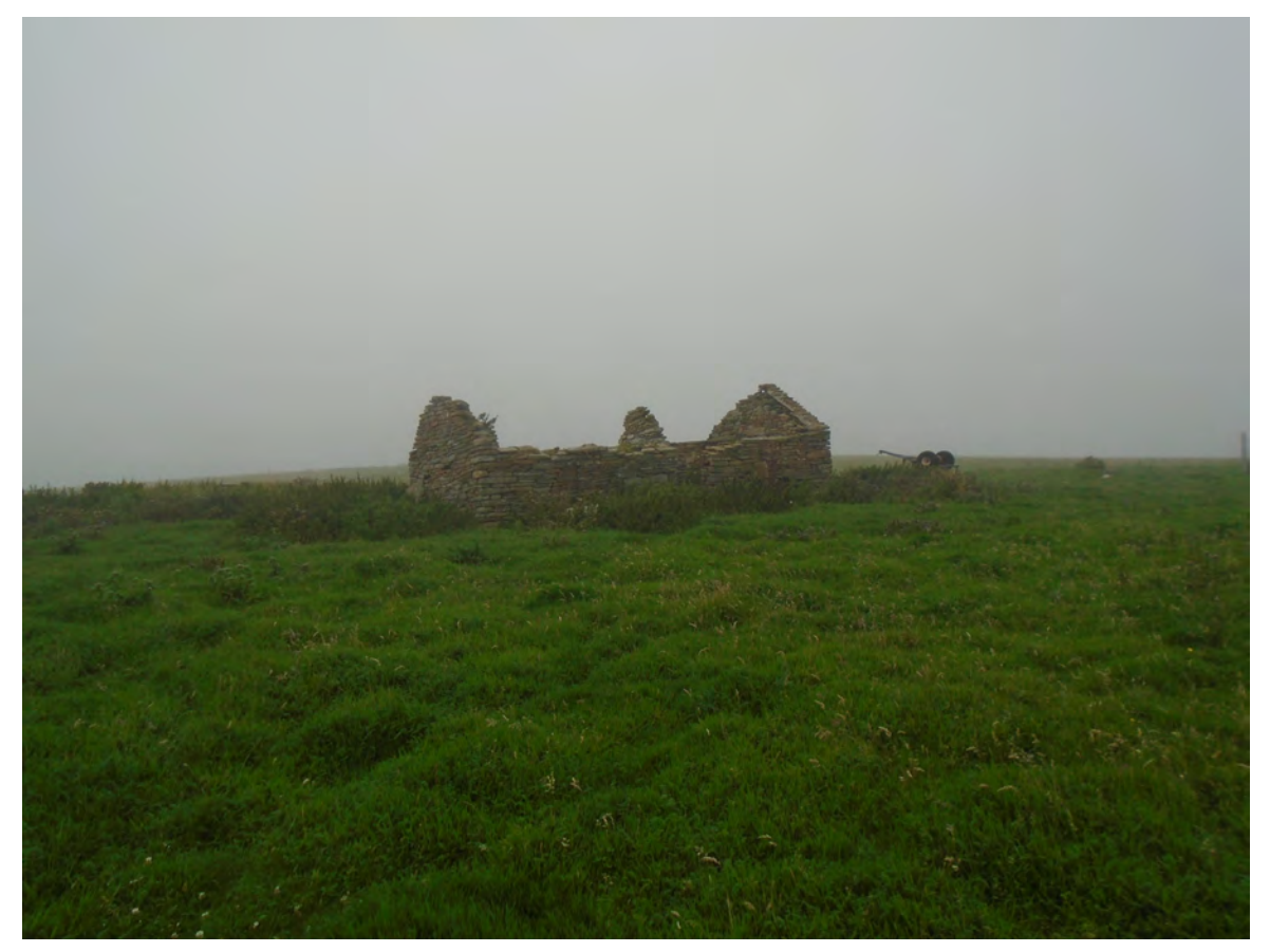
Plate 29 Ness (Site 60) from south