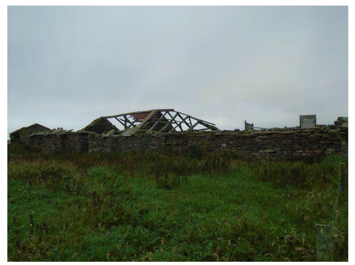
Plate 19 Doggerboat (Site 53) from south-east