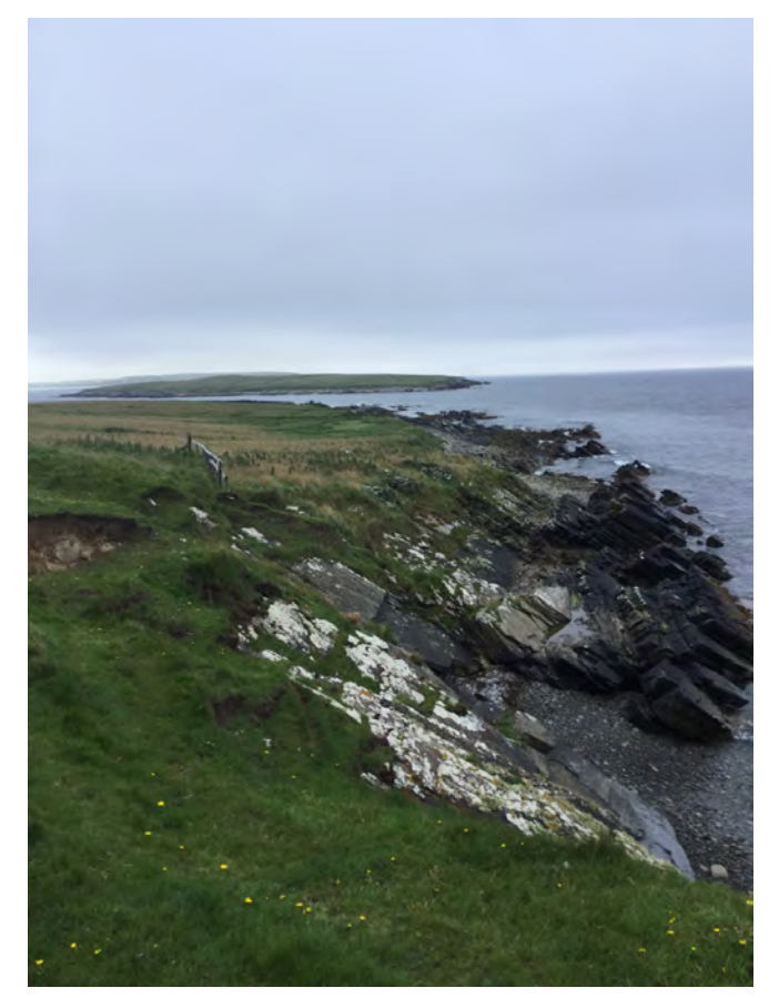
Plate 37 Reamins of walls (Site 91) eroding from cliff edge from south