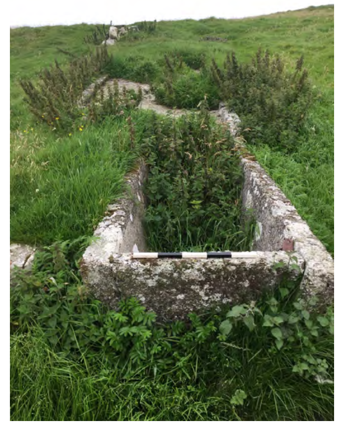
Plate 40 Sheep dip (Site 110) from west