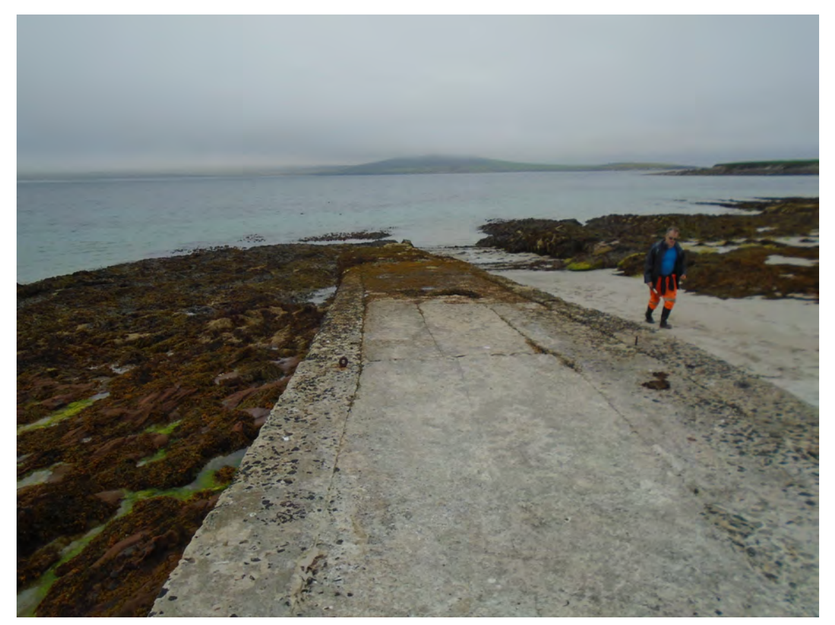
Plate 33 Concrete slipway (Site 119) from north-west