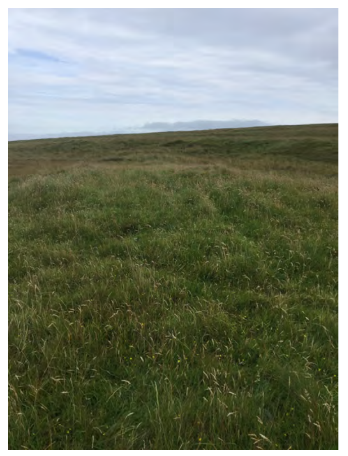
Plate 39 Quarry scoop (Site 106) from south