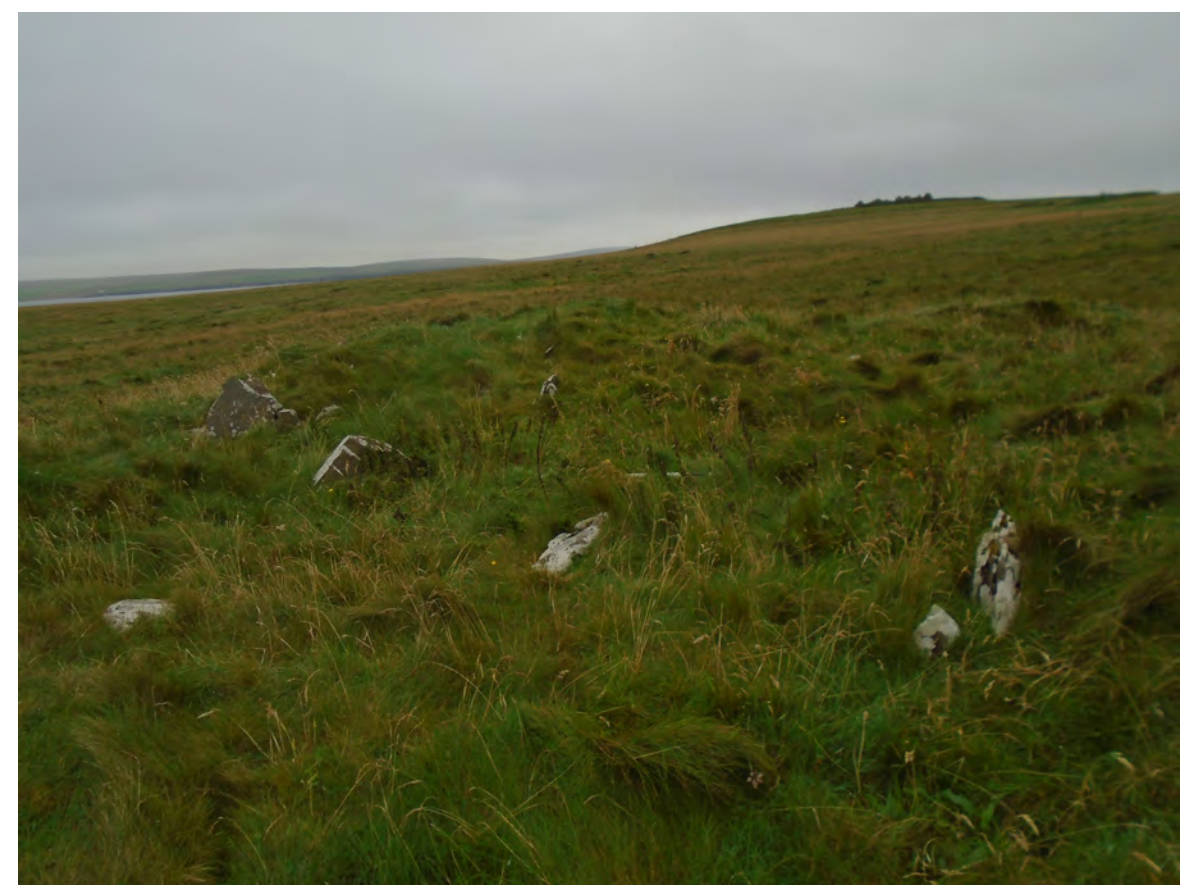
Plate 11 Centre of Faray Chambered Cairn (Site 1) from north.