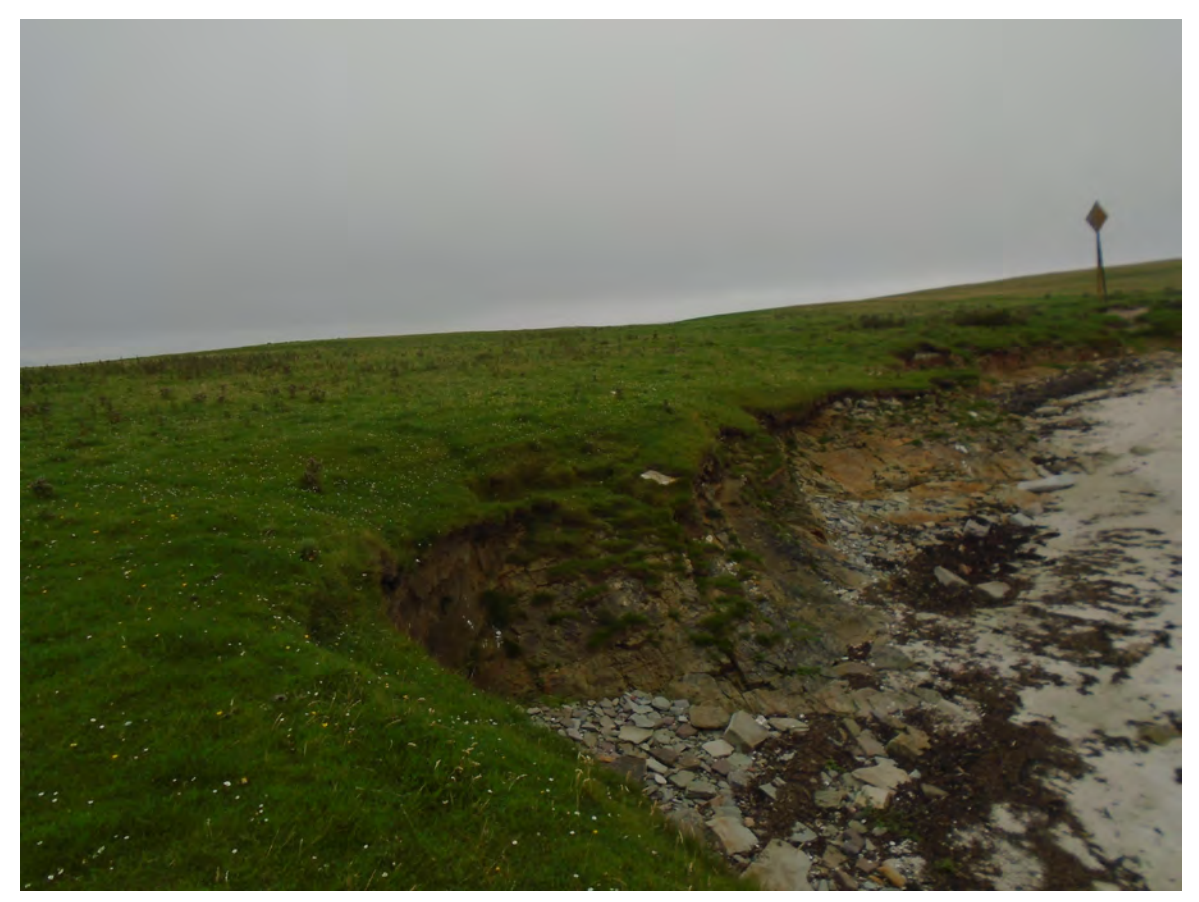
Plate 36 Location of former nausts (Site 11) from south-east