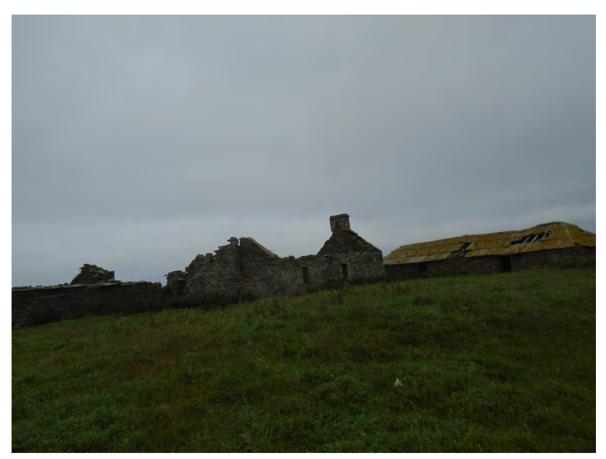
Plate 18 Cott (Site 52) from south-east.