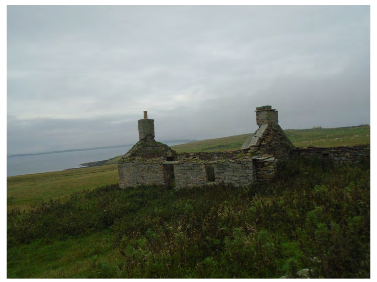
Plate 27 Windywall (Site 58) from south-east