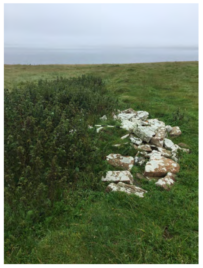
Plate 1 Clearance cairn (Site 79) adjacent to drainage ditch from west