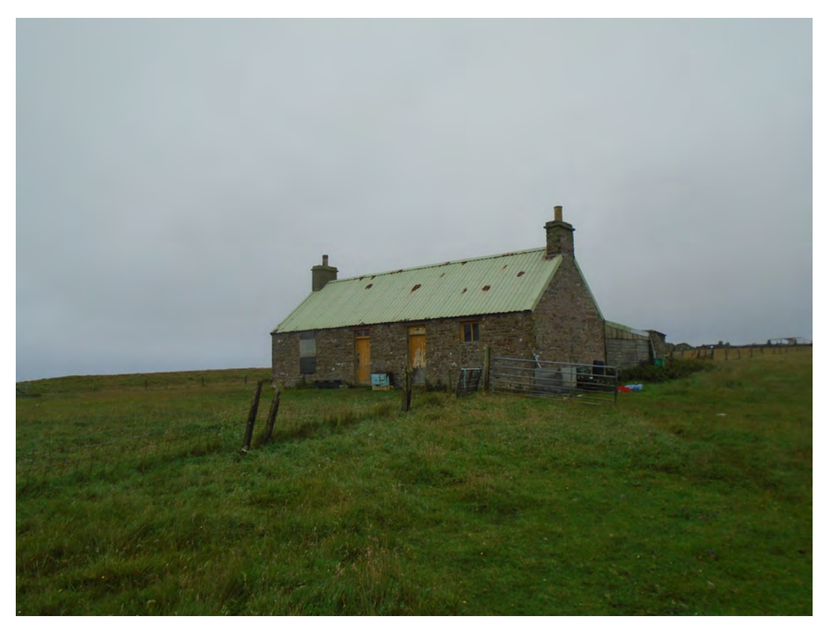
Plate 20 School (Site 54) from south-east