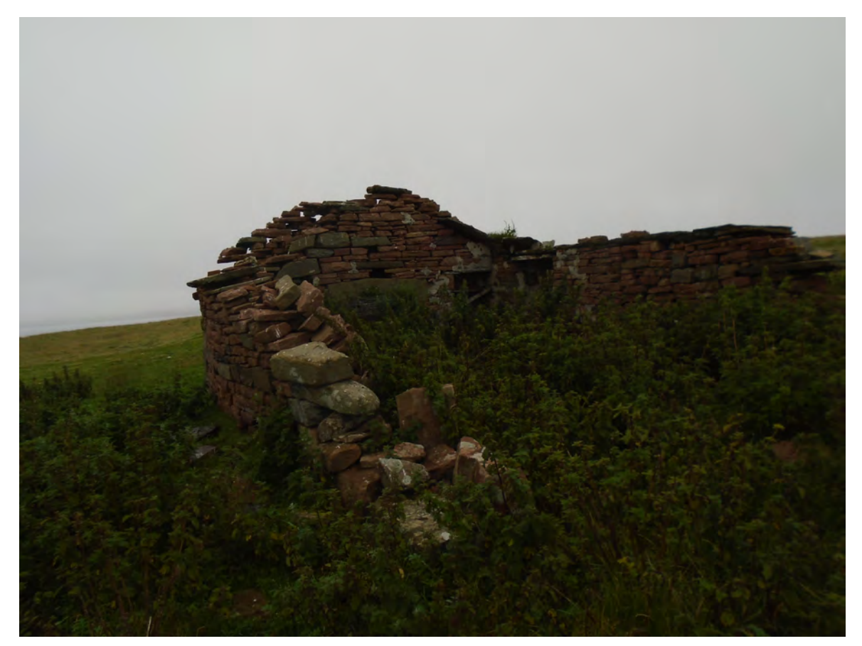
Plate 26 The Hill (Site 56) from north-west