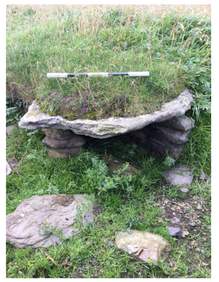
Plate 42 Stone feature (Site 94) from east