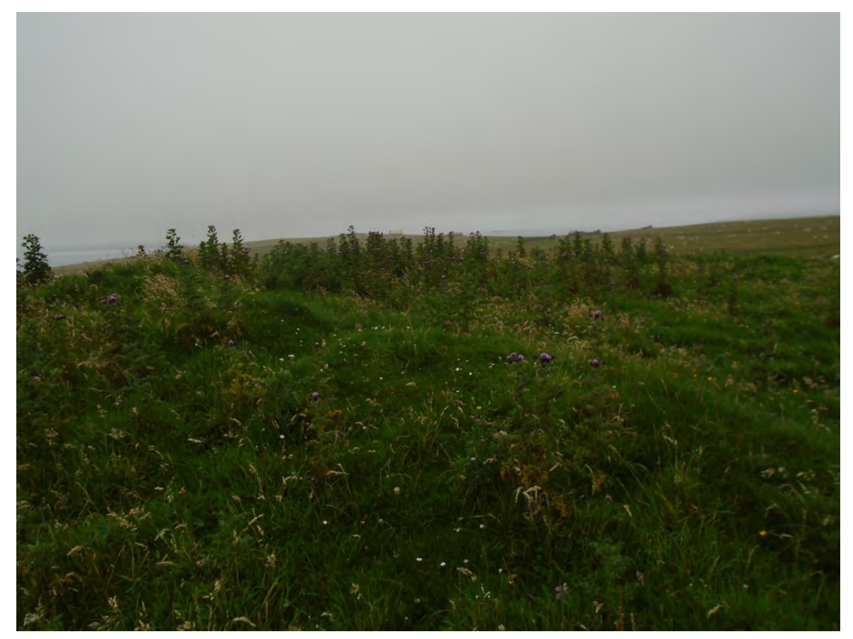
Plate 9 Mound (Site 4) from south