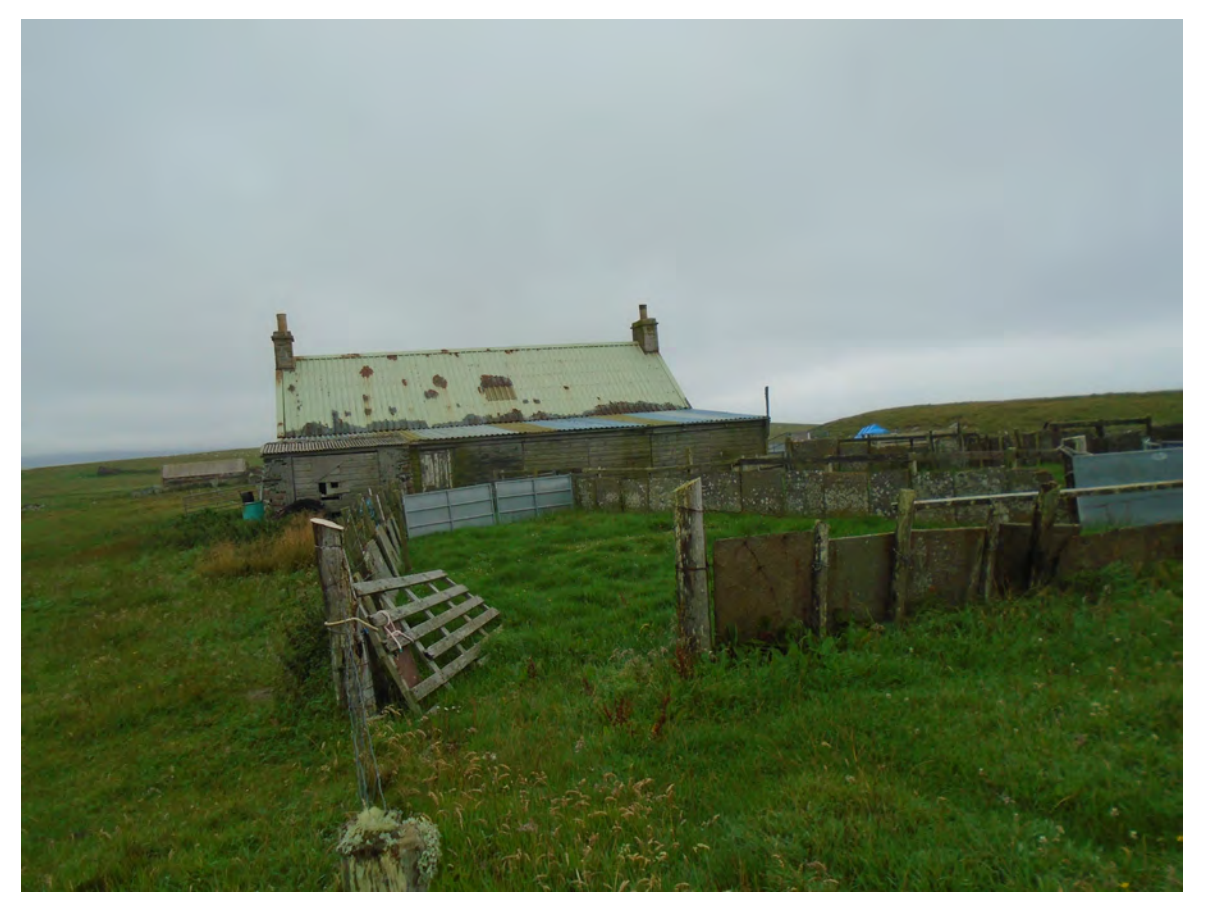
Plate 21 Rear of school (Site 54) and flagstone fence from north