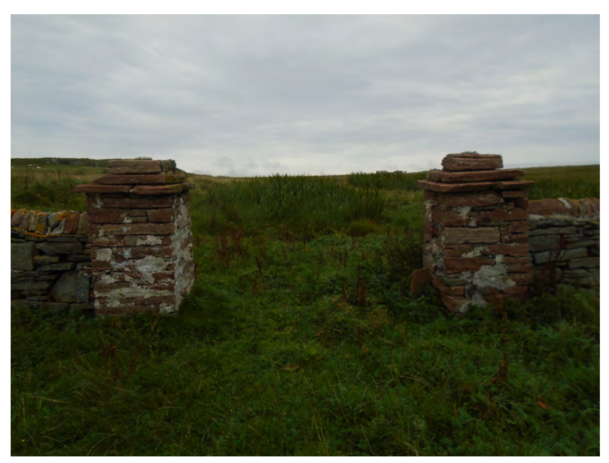
Plate 14 Entrance to burial ground (Site 8) from west