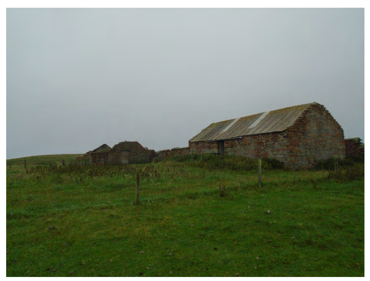
Plate 22 Hamar (Site 55) from south-east