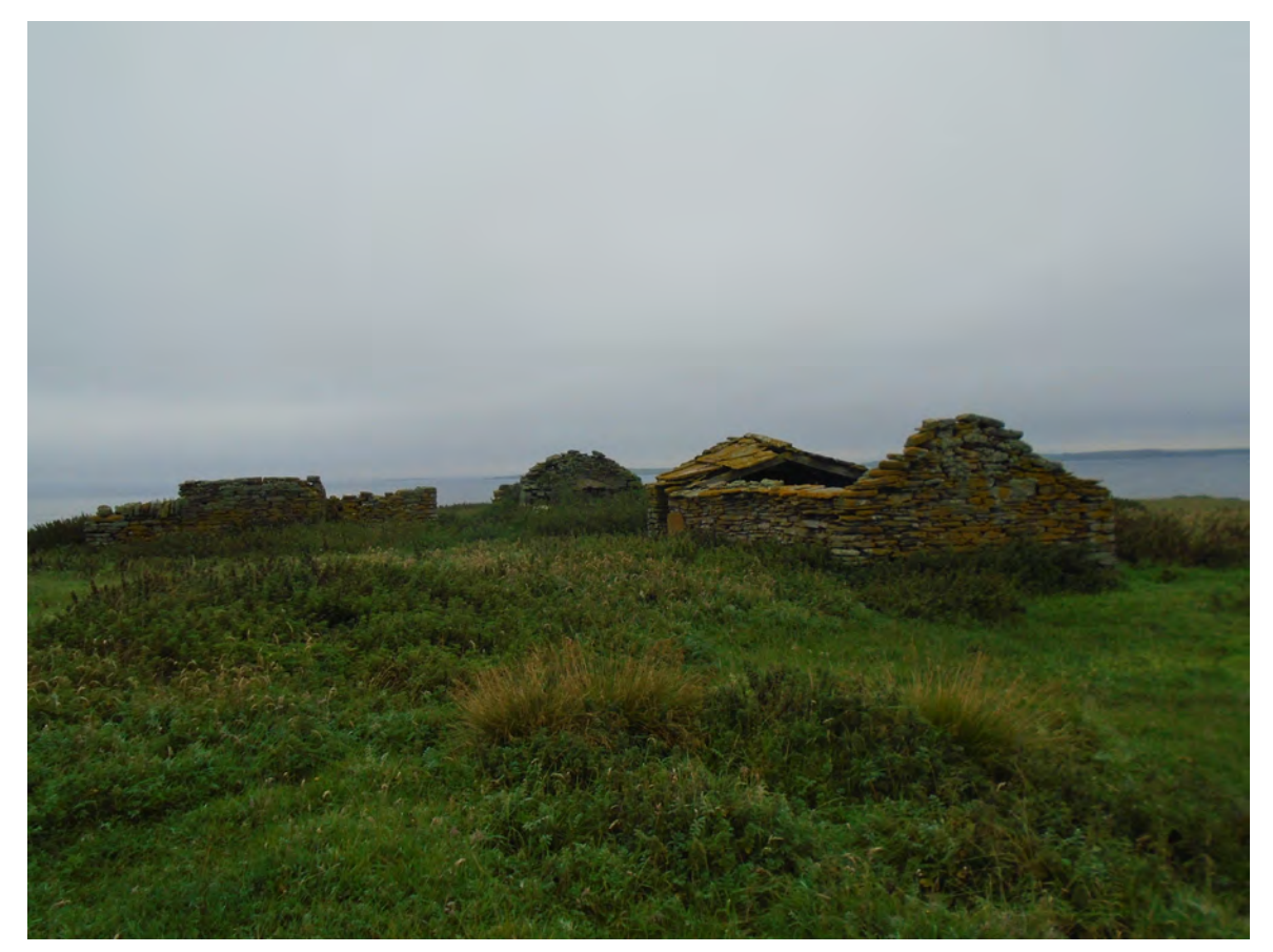
Plate 17 Quoy (Site 51) from east