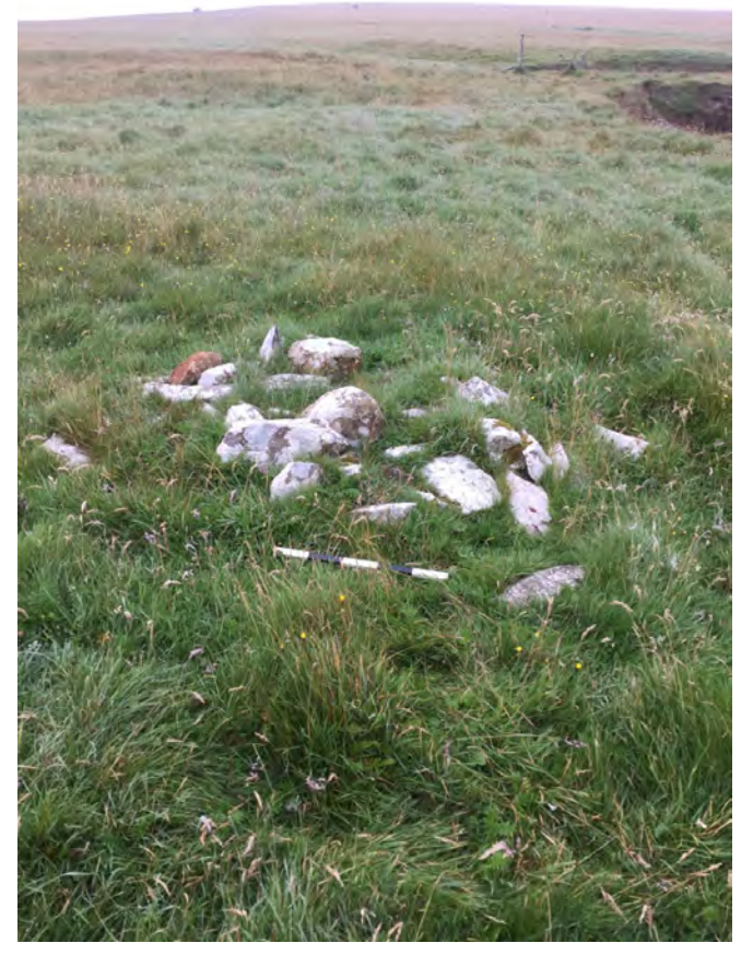
Plate 6 Cairn (Site 77) on east coast from south