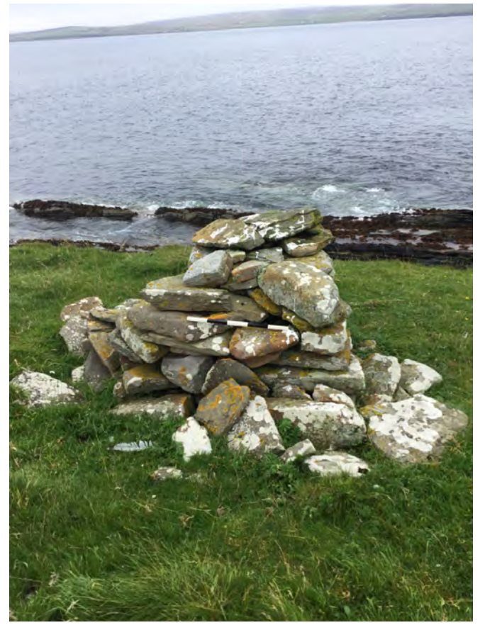
Plate 2 Cairn (Site 90) close to coastal edge from west