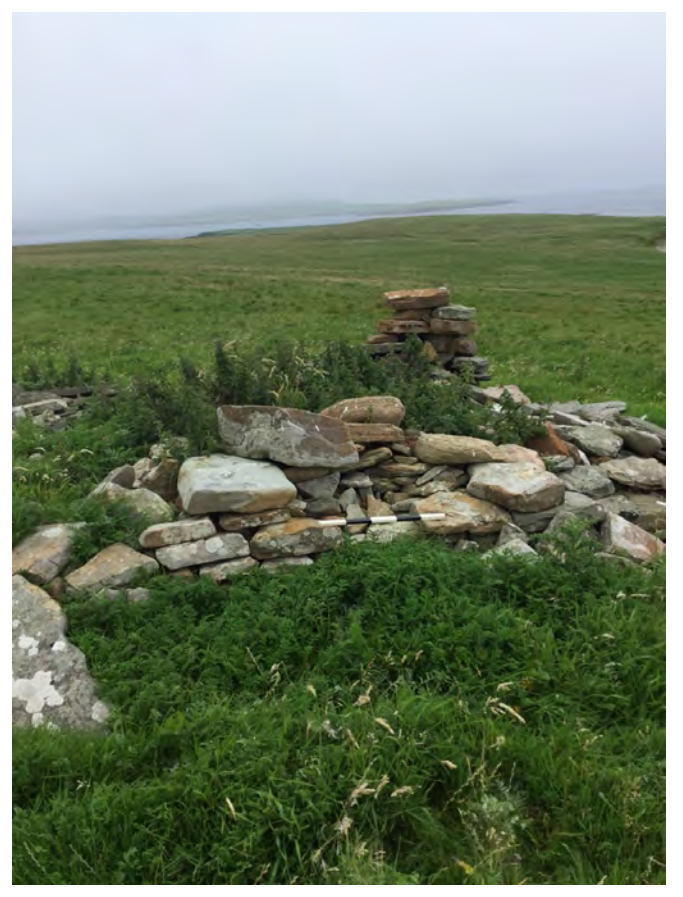
Plate 3 Structural remains (Site 111) from north.