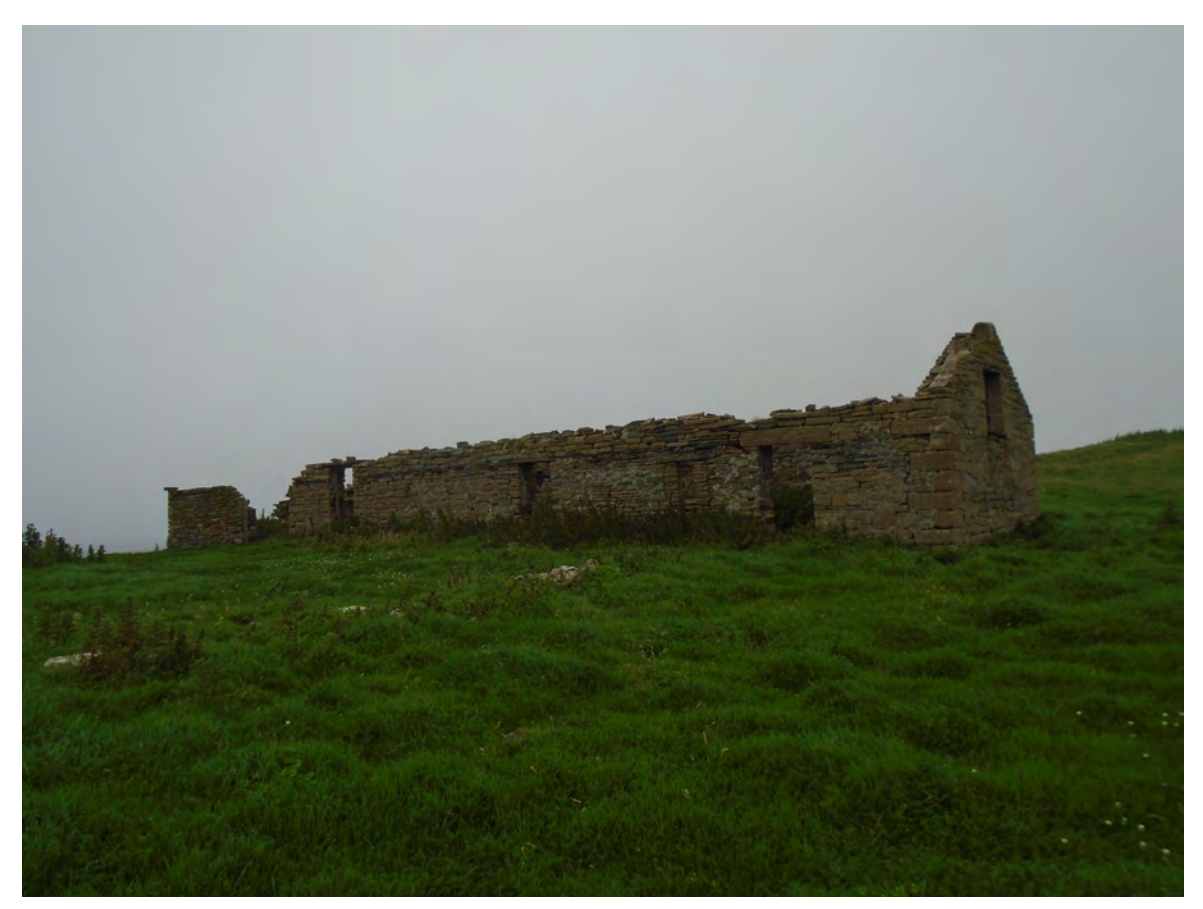
Plate 28 Holland (Site 59) from south-east