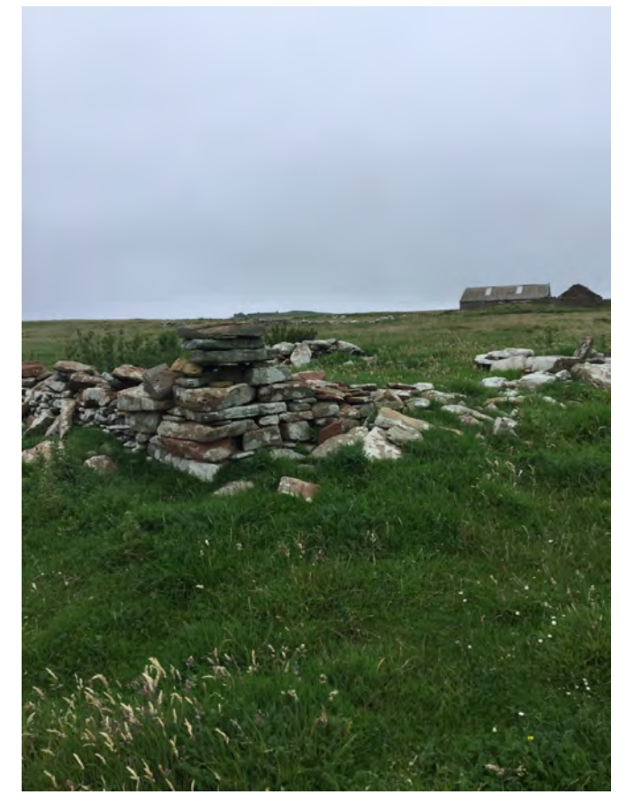
Plate 30 Site 115 from south