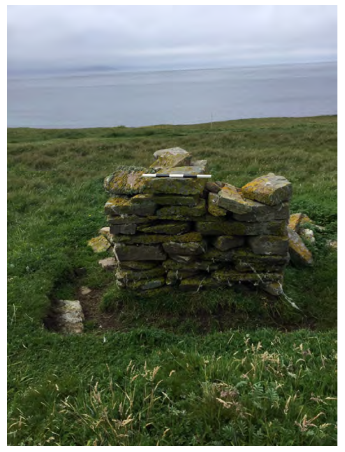
Plate 7 Neatly stacked cairn (Site 97) on west coast from east.