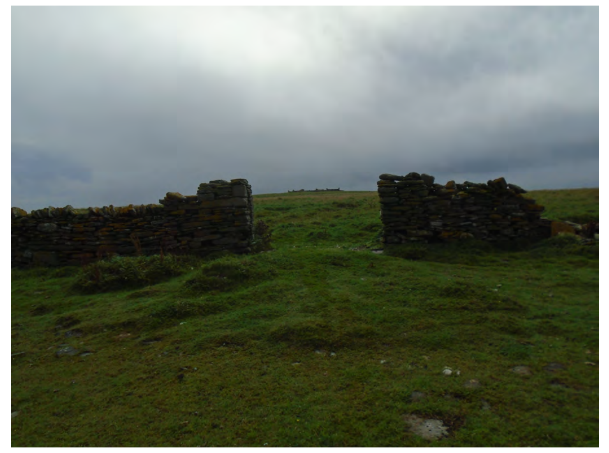
Plate 13 View of entrance to sheep dyke (Site 65) from north