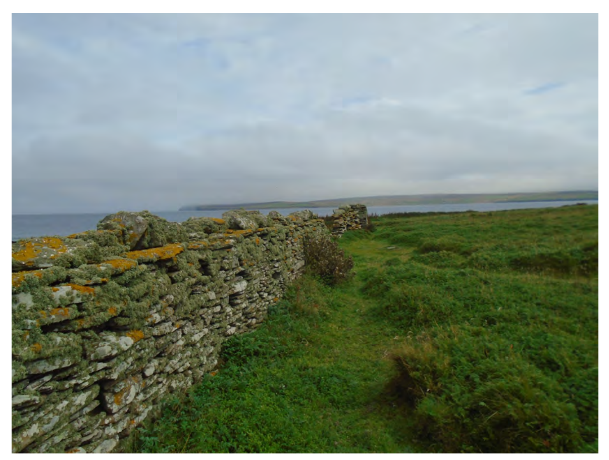
Plate 12 View along sheep dyke (Site 65) from east