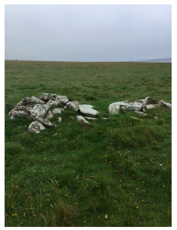
Plate 5 Cairn (Site 76) on east coast from east