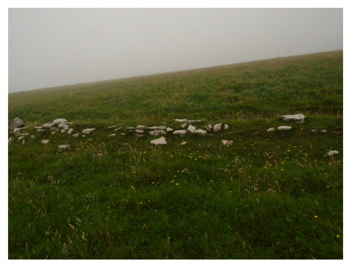
Plate 32 Detail of road (Site 114) construction from west