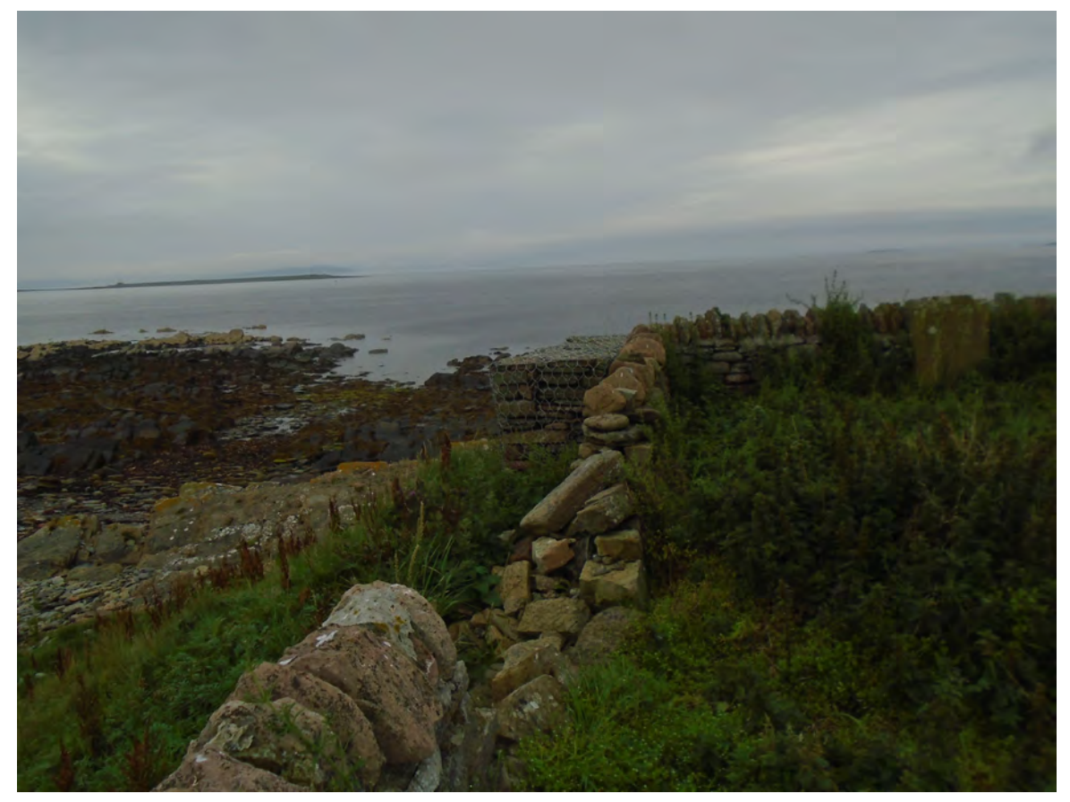
Plate 15 Gabions in north-west corner of burial ground (Site 8) from south-east