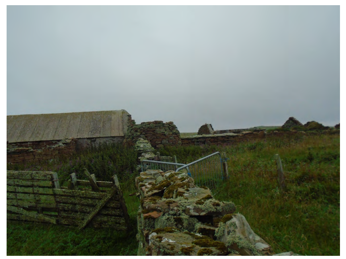
Plate 23 Kiln at Hamar (Site 55) from east