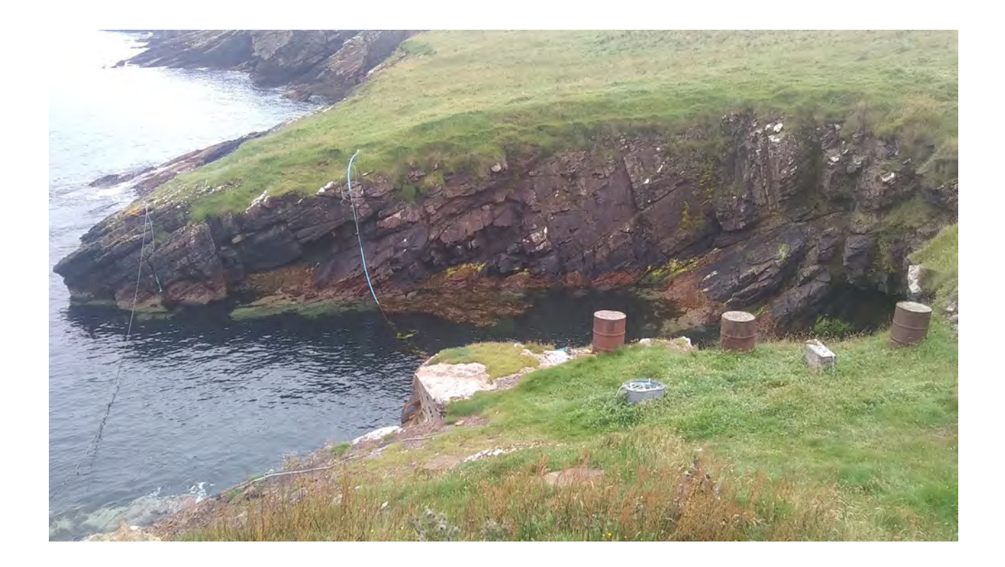
Plate 35 Landing area at Djubi Geo (Site 121) from north