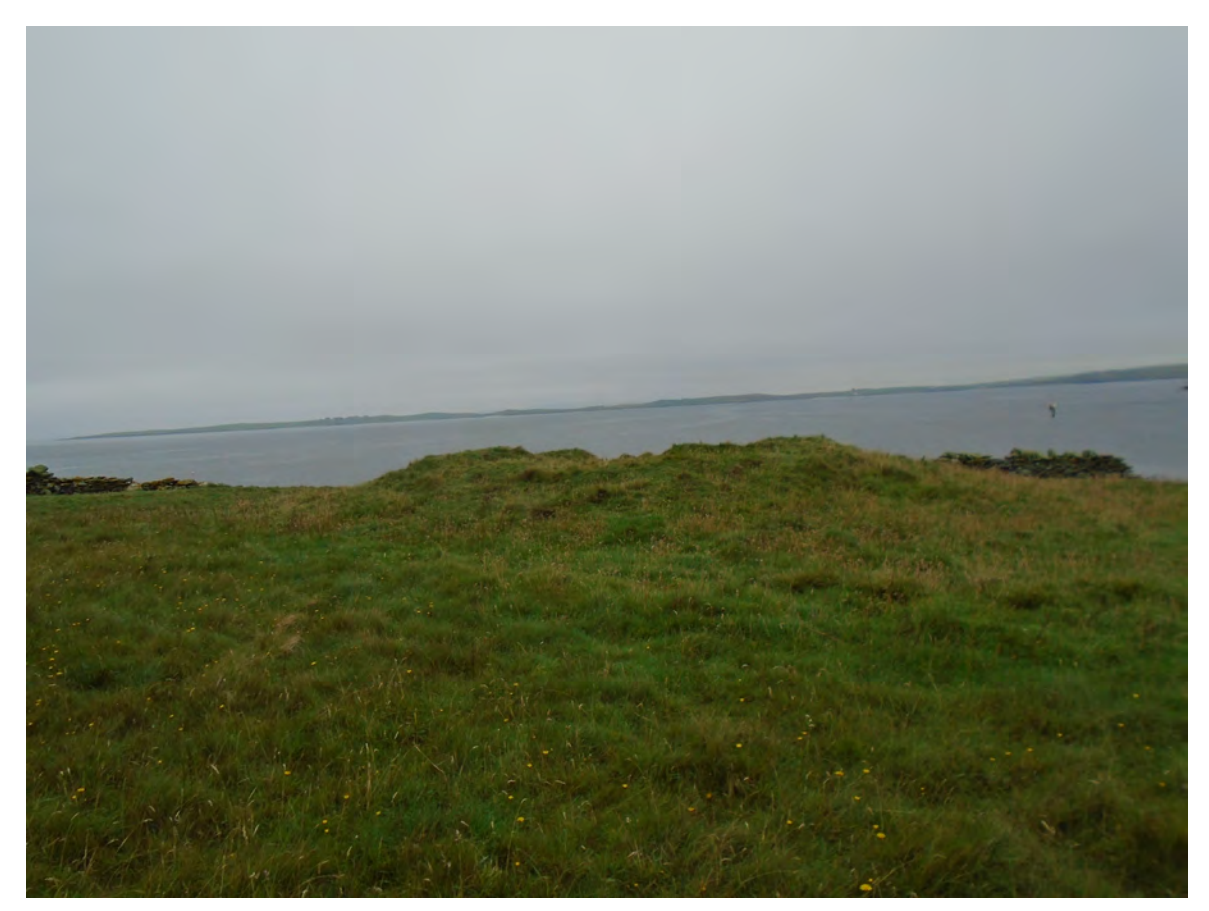
Plate 10 View towards Faray Chambered Cairn (Site 1) from south.