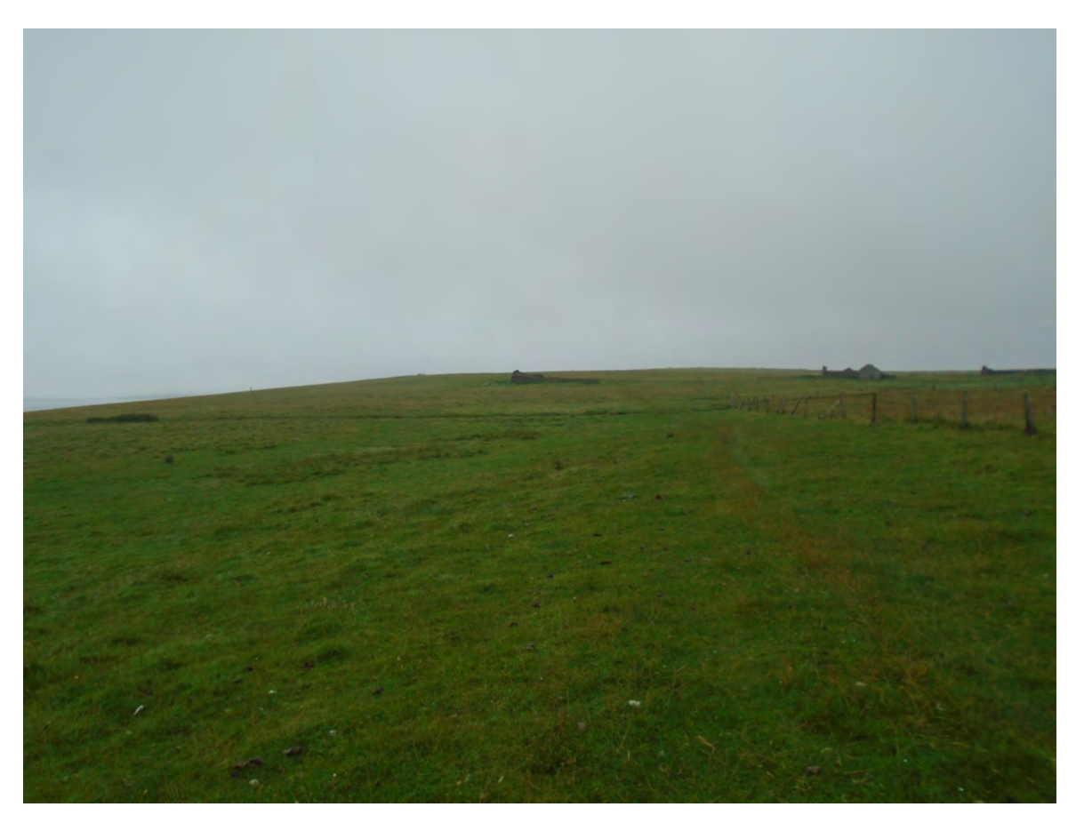
Plate 24 View towards Lackquoy (Site 57) and Roadside (Site 14) from south