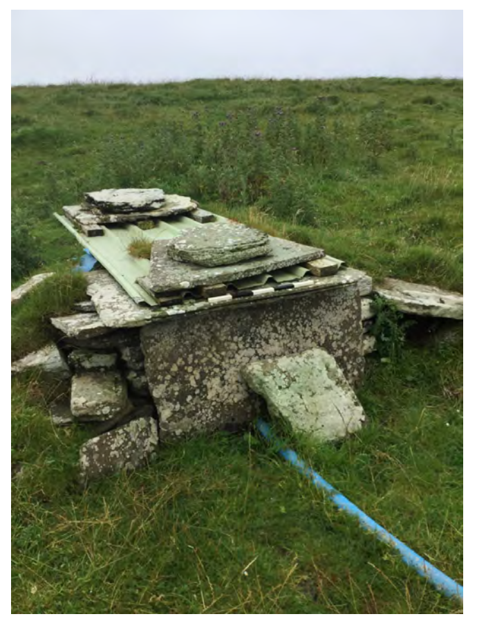
Plate 41 Water tank (Site 93) from north