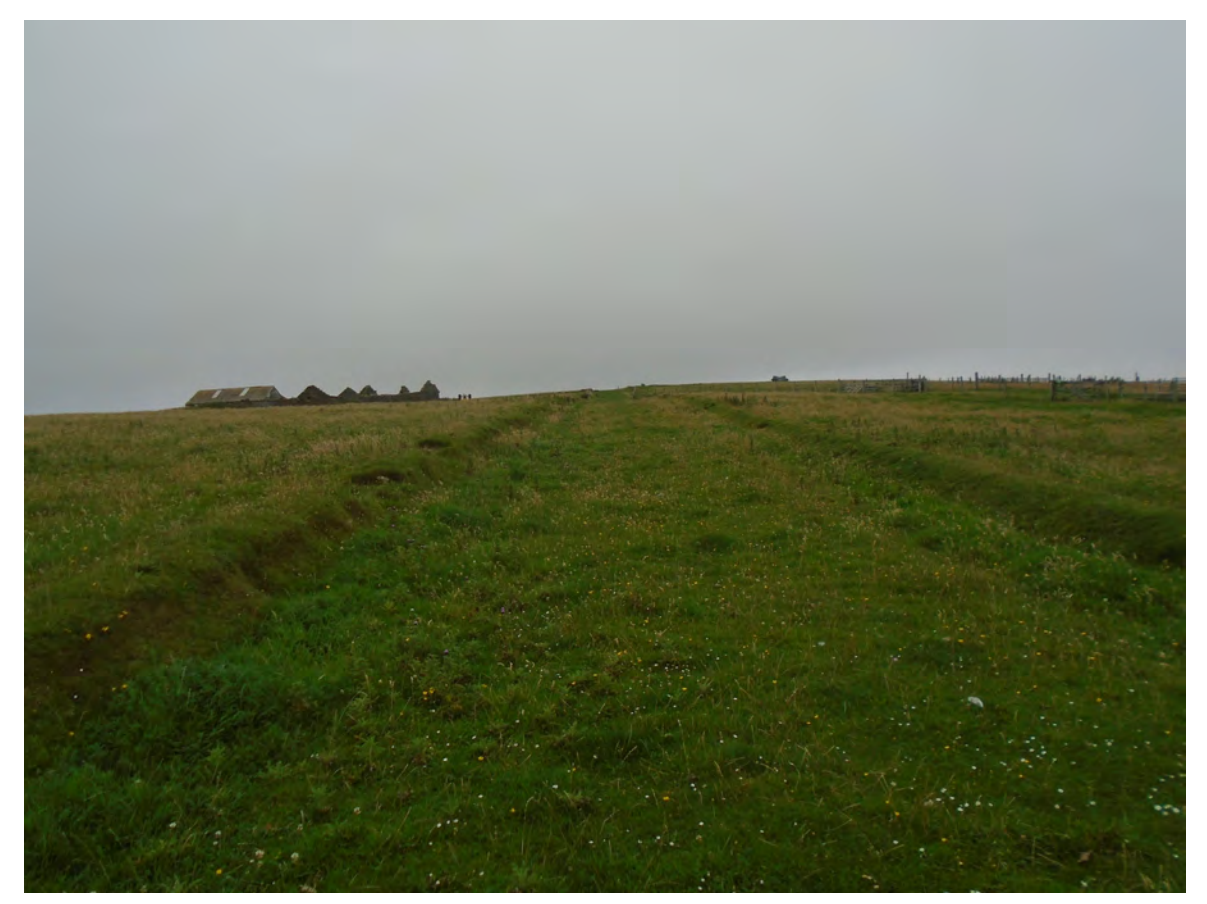
Plate 31 The road (Site 114) from south