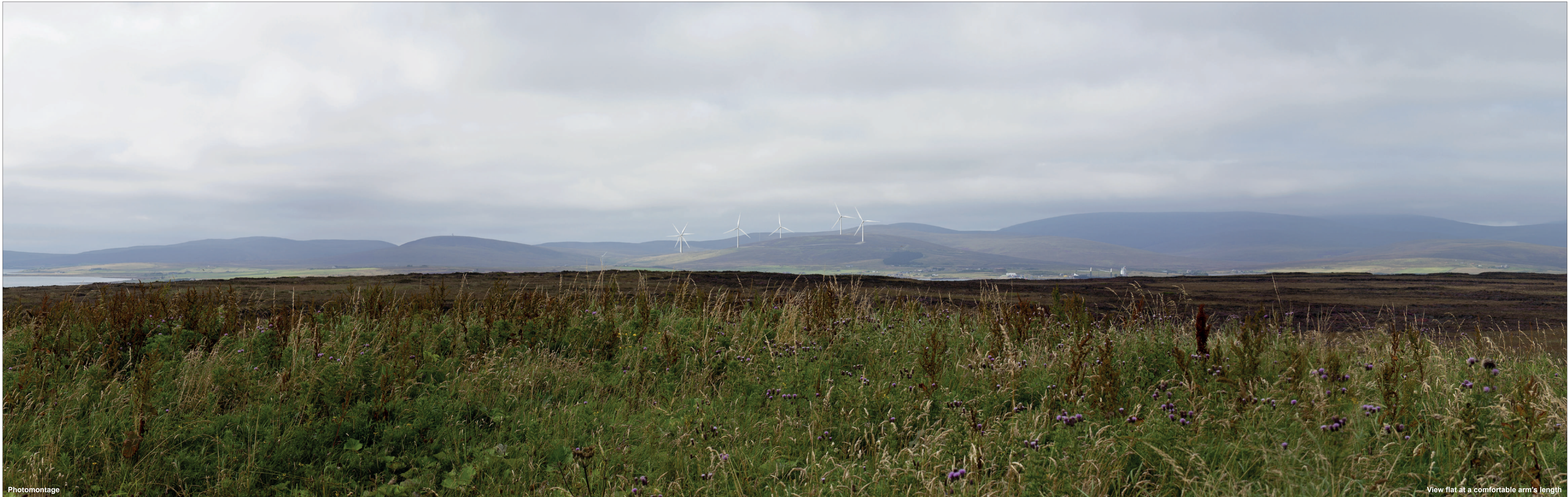
OS reference: 335267 E 993886 N Horizontal field of view: 53.5° (planar projection) Camera: Canon EOS 5D Mark II Eye level: 59.33 m AOD Principal distance: 812.5 mm Lens: EF50mm f/1.4 USM Direction of view: 272° Paper size: 841 x 297 mm (half A1) Camera height: 1.5 m AGL Nearest turbine: 6.193 km Correct printed image size: 820 x 260 mm Date and time: 17/08/20, 12:46 Figure: 6.16g Viewpoint 2: West Hill, Flotta